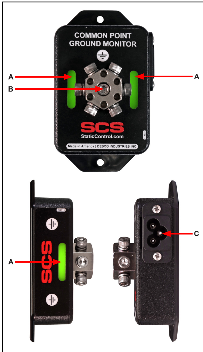
Figure 2. Common Point Ground Monitor features and components

A. Status LEDs: Illuminates green when the AC outlet is properly wired and its path to equipment ground via the equipment ground conductor is intact. Illuminates red and audible alarm sounds when the AC outlet is not properly wired and its path to equipment ground via the equipment ground conductor is broken.