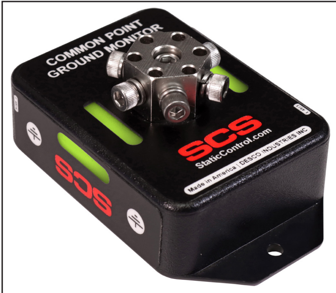
Figure 1. SCS Common Point Ground Monitor