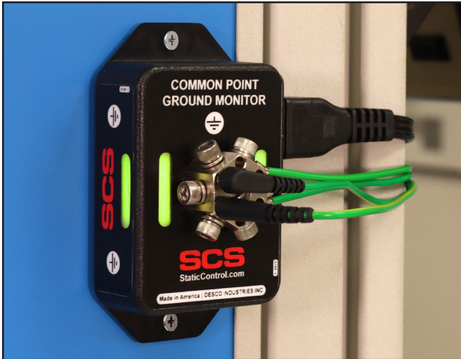
Figure 4. Using the Common Point Ground Monitor

Use the banana jacks on the ground hub to connect banana plugs to ground. Use the 6 included socket head screws and split washers to secure ground wires with ring terminals.